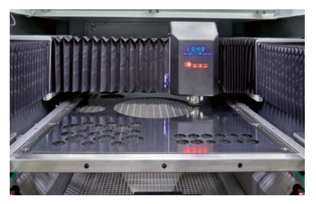
Flatbed frame used with the StencilLaser G 6080

The data for the design of the support grid are also supplied so that the pointed support posts can be reproduced with the StencilLaser at any time and replaced when necessary. This gives the user full control over the only parts on the frame that are subject to wear.